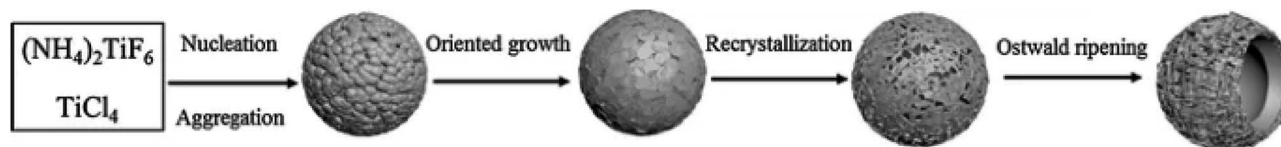
Fig. 6 Schematic illustration of the probable formation mechanism of hollow porous \text{TiO}_2 microspheres. 97

The poor ionic and electronic conductivity of \text{TiO}_2 leads to a capacity far below the theoretical value and poor rate performance, which hinders its practical application in LIBs. Although the preparation of \text{TiO}_2 nanomaterials with a high surface area exhibits good electrochemical performance, it is still difficult to meet the commercial demand. For this reason, it is usually necessary to compound \text{TiO}_2 with other materials, and this review introduces the research progress of different types of \text{TiO}_2 composites, mainly from the compounding of \text{TiO}_2 with carbon, silicon, metals, and metal oxides. 105