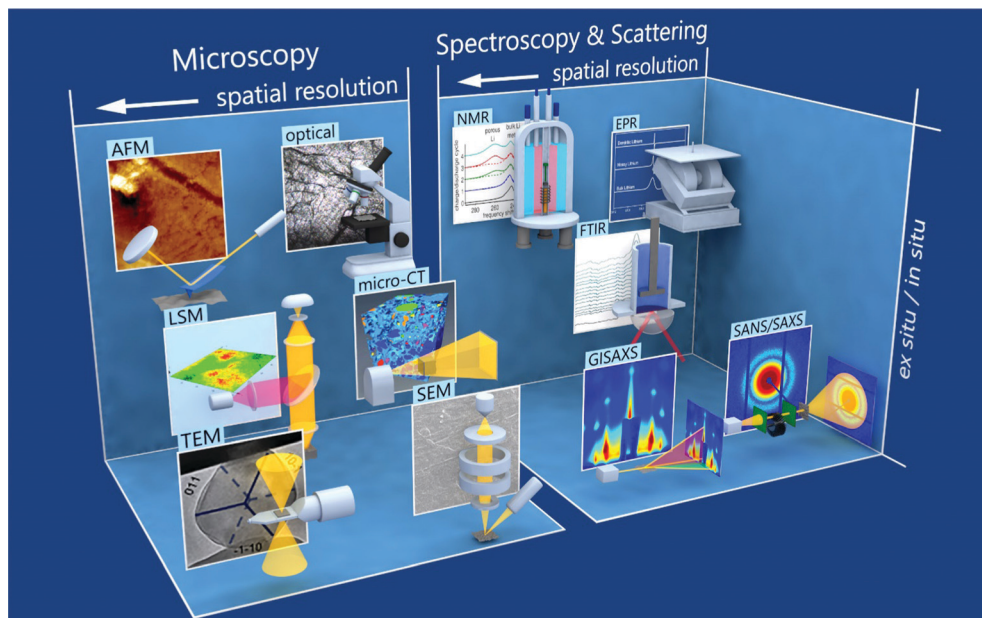
Fig. 1 Various methods for studying metallic lithium are schematically presented, along with a typical result, and are divided into microscopic and spectroscopic & scattering techniques. Microscopic techniques include transmission electron microscopy (TEM), 14,15 scanning electron microscopy (SEM), 9 laser scanning microscopy (LSM), 16 micro computed tomography (micro-CT), 17 atomic force microscopy (AFM), 18,19 and optical microscopy. 20 Spectroscopic & scattering techniques include grazing-incidence small angle X-ray scattering (GISAXS), 21 small-angle neutron scattering (SANS), 22 Fourier-transformed infrared (FTIR), 8,23 nuclear magnetic resonance (NMR), 24,25 and electron paramagnetic resonance (EPR). 24 Spectroscopy. Within the classifications and individual rows, the spatial resolution becomes higher the more left the method is depicted. From bottom to top, it is indicated if a technique is rather used ex situ or in situ . Details on the different characterization techniques are given in Section 5.

has been made towards a clearer picture of how current, potential, and SEI influence the nucleation.