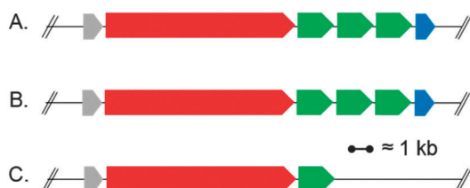
Fig. 2 Schematic representation of (A) the PTM biosynthetic pathway in Lysobacter enzymogenes C3 encoding HSAF ( 1 ) 7 and the putative PTM pathways in (B) L. capsici DSM 19286 and (C) Saccharophagus degradans DSM 17024. Genes putatively coding for: red: iterative PKS–NRPS system; green: oxidoreductase; blue: alcohol dehydrogenase; grey: sterol desaturase (SD).

We next examined the utility of pSDs Lcap to provide the hydroxylating SD biocatalyst in vivo . The plasmid was transferred into our recently reported E. coli BAP1 14 based ikarugamycin ( 4 ) heterologous production system 8 by electroporation. Both the transcription of the ikarugamycin ( 4 ) pathway genes as well as of the SD gene from L. capsici were controlled by lacI . Fermentation of the resulting strain in ZY autoinduction media 15 revealed the exclusive production of the 3-hydroxylated derivative of 4 (see Fig. 3D), a compound very recently isolated as the natural product butremycin ( 5 ) from Micromonospora sp. K310. 16 Ikarugamycin ( 4 ) was not detectable in these experiments at all, revealing its highly effective, complete conversion to 5 catalysed by SD in vivo . 17 Because of the identical chromatographic behaviour of 5 produced by our approach compared to 5