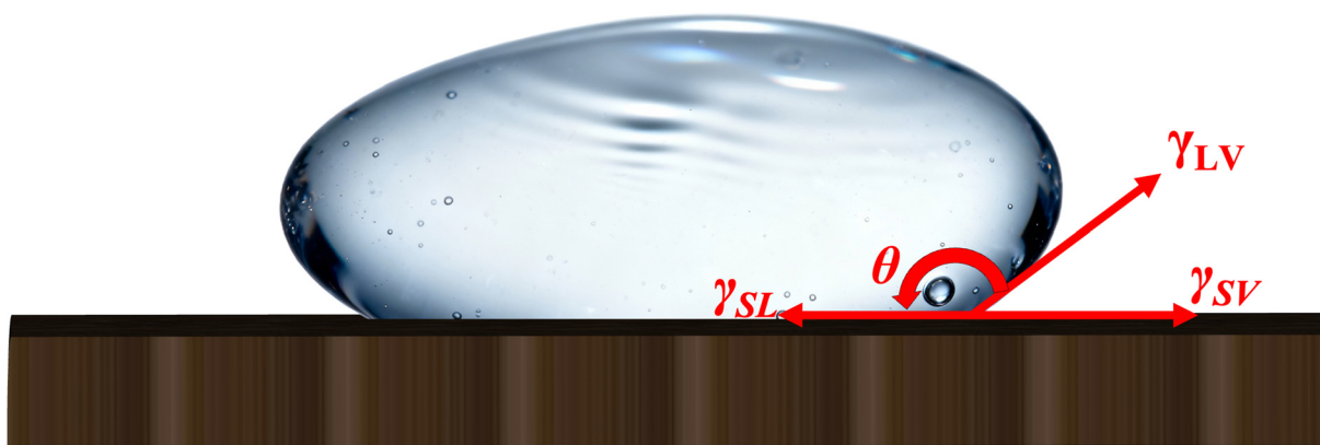
Fig. 4 Three vector components of Young's equation: solid–liquid ( \gamma_{SL} ), solid–vapor ( \gamma_{SV} ), and liquid–vapor ( \gamma_{LV} ) surface tensions. \theta is the contact angle.

2.2.1 Wenzel model. Robert Wenzel recognized that surface roughness increases the actual solid–liquid contact area compared to the droplet's horizontal projection, and this