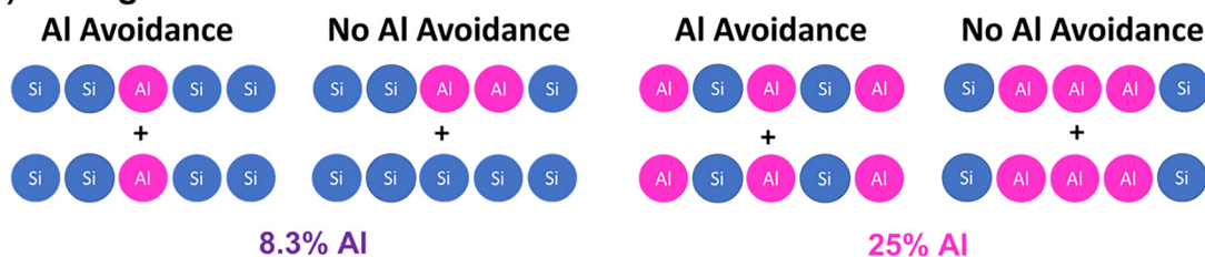
Fig. 2 Model construction outlining the three general variables. (1) Composition – stoichiometry varying with increasing Al amount. (2) Order/disorder – the topology of the model varying between the classical layered approach for C–S–H seen in literature against the “Disordered” model which represents a more homogenous blend of phases. Pore vs. hydrated pore (3) Al avoidance, resolving the influence of (non-)neighbouring Al atoms.

The mass ( m ) of each cluster is \sim 6.58 \times 10^{-21} g and with C–S–H having density ( \rho ) \approx 2.6 g cm ^{-3} when Ca/Si = 1.7, produces a target unit cell volume ( V ) of \sim 2.531 \times 10^{-21} cm ^{-3} or 13.6 Å ^3 , where V = m/\rho . Volume may be quantified via simple multiplication of 3 chosen orthogonal axes else more rigorous means of evaluation (Section S1). This resulted in a pore that demonstrates changing structure, yet does not collapse in the NPT or NVE run trajectories. Models of the same nature were also constructed at quadruple the scale (984 atoms) and subjected to a similar simulation protocol of relatively short NPT and NVE runs. These larger models could be used to demonstrate whether the coalescing of layers in ordered C(A)–S–H models was a conserved property, regardless of scale. The overall objectives of the AIMD simulations are summarised below: