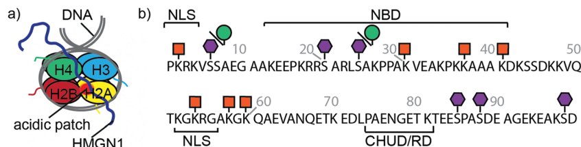
Fig. 1 HMGN1 interacts with nucleosomes and bears phosphorylation, ADP ribosylation and acetylation PTMs. (a) Schematic structure of a nucleosome comprising dimers of each of the four histones H2A, H2B, H3 and H4 wrapped by DNA. HMGN1 (dark blue line) is an intrinsically disordered protein that binds to nucleosomes. Orientation and interaction of HMGN1 is based on that reported for HMGN2. 26 (b) Protein sequence, domains and PTMs of HMGN1. 27,28 Amino acids are represented by their one-letter codes and residue numbers are shown in grey. NLS = nuclear localization signal, NBD = nucleosome-binding domain, CHUD/RD = chromatin unfolding domain/regulatory domain. Lysine acetylation is represented by an orange square, serine phosphorylation by a purple hexagon and ADP ribosylation by a green circle.

Although the precise mechanisms by which HMGN proteins modulate epigenetic processes are still not clear, several studies indicate that these nucleosomal proteins regulate cell-type-specific gene expression, and therefore have potential implications in developmental processes and disease. 11 For example, HMGN proteins have been reported to function as alarmins, 17–19 to have both pro- 20 and anti-tumour 21 activities and to have roles in DNA repair, 22,23 immune regulation 17 and Down syndrome. 11,24 These studies, amongst others, highlight the need to understand the molecular-level interactions of HMGN1.