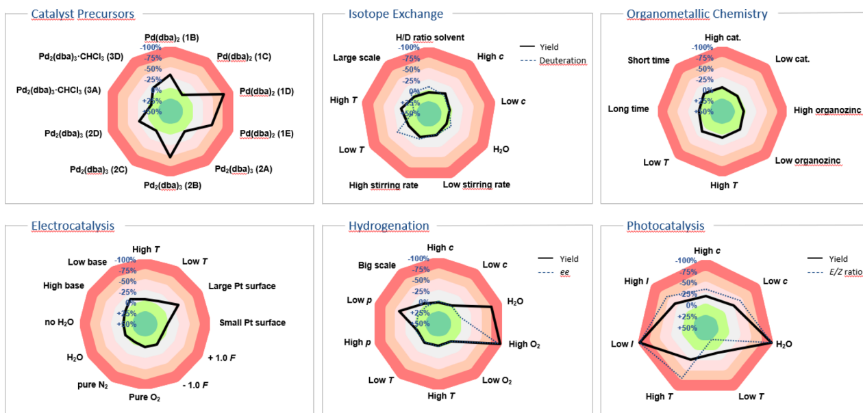
Fig. 2 Examples showcasing sensitivity screens tailored to diverse research fields. 13–16 In instances like hydrogenation, isotope exchange and photocatalysis the sensitivity screen was utilised to illustrate two target values, such as yield/deuterium incorporation, yield/enantiomeric excess and yield/ E:Z ratio, along with the parameters' impact on them.

Our innovation was embraced by the scientific community and has since been widely adopted for applications beyond the originally suggested ones. Originating from a background in photochemistry, we initially considered only yield as the target value and parameters such as: temperature, concentration, oxygen and moisture levels, light intensity, and scale. The use of the sensitivity screen within the scientific community, including our own group, has led to its adoption modified with additional parameters and target values. While the target value was formerly only yield, researchers have suggested and applied conversion, product ratio, selectivity, ee, throughput, TON, radiochemical yield (RCY), molar/specific activity ( A_m/A_s ), H/D -ratio, purity, space-time yield and enzyme activity, 12 and the standardisation of these terms has been a central achievement of the chemical community (Fig. 2). 13–16 Especially for industrial processes with more than one desired product, the reaction can be steered towards a customised product distribution, which might alter given the demand of the chemical product. A radar