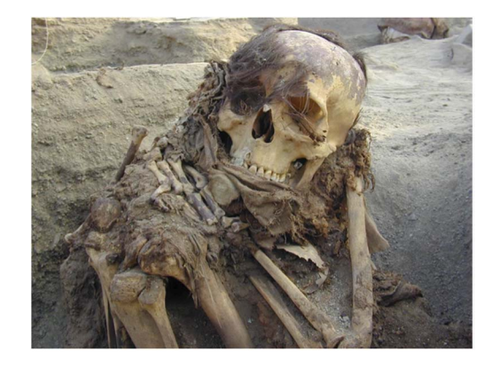
Fig. 1 Sample 28 in situ at the excavation site at Puruchuco-Huaquerones, Peru.

Eight human hair samples and nine mummy hair samples were used in this study, sample names and classifications are shown in Table 2. All nine mummy hair samples originate from mummified individuals from Puruchuco-Huaquerones, Peru (Fig. 1). The hair was collected directly from the mummified heads of individuals who had abundant hair (a minimum of 20 strands). A scalpel (cleaned with alcohol) was used to excise a portion of the scalp with the hair embedded. If the mummy had been exposed or was poorly preserved, the hair would no longer adhere to the scalp but be lying next to the scalp in the wrappings surrounding the head. In this case, it was collected by hand and the scalp end wrapped in tinfoil and then taped secure to orient the strand. In all circumstances, the hair was still associated with the skull, and it was not taken from any