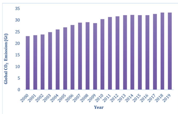
Fig. 1 Energy-related global CO 2 emission in the last two decades. 1c

The activation of CO 2 molecules is an uphill task owing to its high thermodynamic and kinetic stability. 21 Nevertheless, this process is considered to be the key step in the design of any catalytic process for the conversion of CO 2 into value-added products. Although CO 2 has a zero dipole moment, it is a charge-separated molecule with an inherent difference in polarity between its oxygen and carbon atoms. Thus, in contrast to other inert molecules, such as N 2 , the presence of this internal dipole along the C–O bonds makes the CO 2 molecule ambiphilic in nature. The HOMO of the CO 2 molecule is centred on the oxygen atoms, while its LUMO is located on the carbon atom. Consequently, the carbon centre is susceptible to nucleophilic attack, while the oxygen centres can interact with