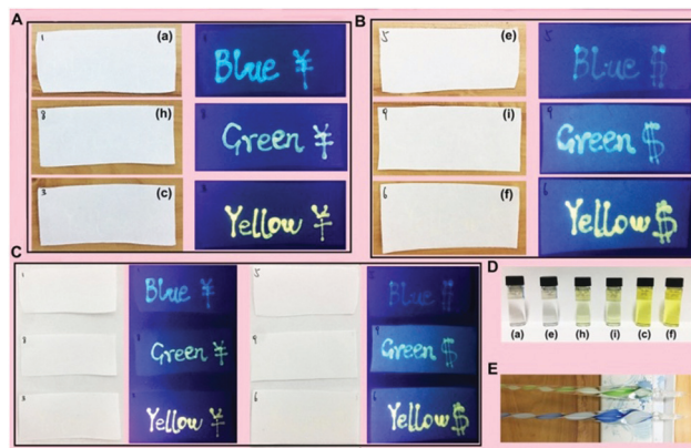
Fig. 4 Fluorescence intensity changes upon changes in temperature and solvents. (A) Application of DSA-G \subset H1-4C4P (a, h, c) and (B) DSA-G \subset H2-2C4P (e, i, f) written on filter paper, (left: under natural light, right: under ultraviolet light, \lambda_{em} = 365 nm) as tunable fluorescent inks. (C) Fluorescent inks of DSA-G \subset H1-4C4P (a, h, c) and DSA-G \subset H2-2C4P (e, i, f) on the same white paper; (a: H1-4C4P ([ H1-4C4P ] = 50 \mu M); h: DSA-G \subset H1-4C4P ([ H1-4C4P ] = 50 \mu M, [ DSA-G ] = 10 \mu M); c: DSA-G \subset H1-4C4P ([ H1-4C4P ] = 50 \mu M, [ DSA-G ] = 100 \mu M); e: H2-2C4P ([ H2-4C4P ] = 50 \mu M); i: DSA-G \subset H2-2C4P ([ H2-2C4P ] = 50 \mu M, [ DSA-G ] = 10 \mu M); f: DSA-G \subset H2-2C4P ([ H2-2C4P ] = 50 \mu M, [ DSA-G ] = 100 \mu M)). Images of (D) the solutions and (E) solution-loaded pens.

spectra (Fig. S31 and S32, ESI † ) of DSA-G \subset H1-4C4P and DSA-G \subset H2-2C4P indicated the changes of their diffusion coefficients. Compared with individual DSA-G with the diffusion coefficient of (2.87 \pm 0.08) \times 10^{-9} \text{ m}^2 \text{ s}^{-1} , the diffusion coefficient decreased upon addition of H1-4C4P or H2-2C4P , suggesting that they gradually assembled into large polymeric architectures.