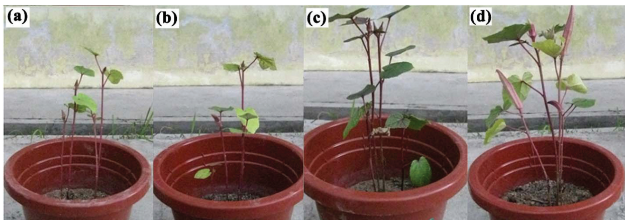
Fig. 15 Okra plant growth after 12 weeks in (a) blank soil, (b) soil with urea, (c) soil with 2 wt% P(AAc)- g -OPEFB and (d) soil with 2 wt% of P(AAc)- g -OPEFB/urea. 40