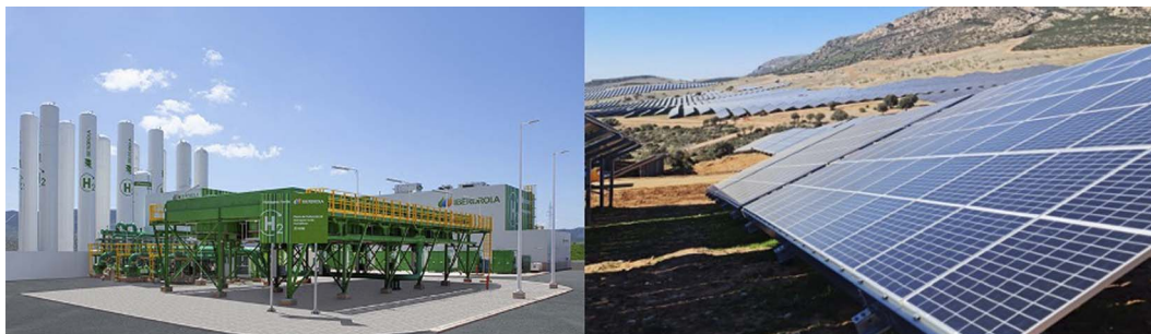
Fig. 16 Green H_2 production facility, Iberdrola, established in the year 2022 in Spain. This water electrolysis facility produces 360 kg of H_2 per hour and is powered by a solar photovoltaic plant with an installed capacity of 100 MW p. The plant also has a Li-ion battery system for streamlined and steady electrical power supply to the plant. This clearly illustrates that green H_2 production requires not only a renewable electricity generation system but also an electrical energy storage system.

The case of producing green H_2 is being pursued actively across the world as it is being forecast to play a significant role in decarbonizing energy generation as well as supplement grey H_2 usage in several hard-to-abate applications. 62 The two main