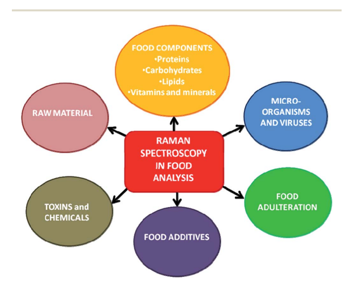
Fig. 2 Schematic presentation of fields in food analysis in which Raman spectroscopy used.

liquid and solid phases at ambient temperature and pressure.<sup>8</sup> Besides, Raman spectroscopy is a potential tool for the assessment of food quality systems during handling, processing and storage.<sup>9</sup>