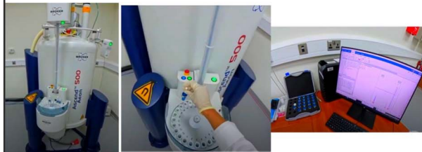
Fig. 5 Screenshot examples of VR videos.

While students initiated the ball-milling process, they did not wait for its full duration; instead, students proceeded with the work-up and purification steps using reaction mixtures prepared in advance by the instructor or previous cohorts. The VR visualization condensed the synthesis step, which typically takes approximately 60 min under real laboratory conditions, into a brief, immersive representation, allowing students to contextualize key stages while concurrently working on other experimental steps. This approach avoids additional waste, as student-initiated samples are retained and used by subsequent cohorts, ensuring continuity of the workflow. The student-prepared ball-milled mixtures were retained for use in subsequent sessions. This integrated workflow ensured efficient use of laboratory time while maintaining student engagement with all key experimental stages from reaction preparation and mechanical grinding to product isolation and purification.