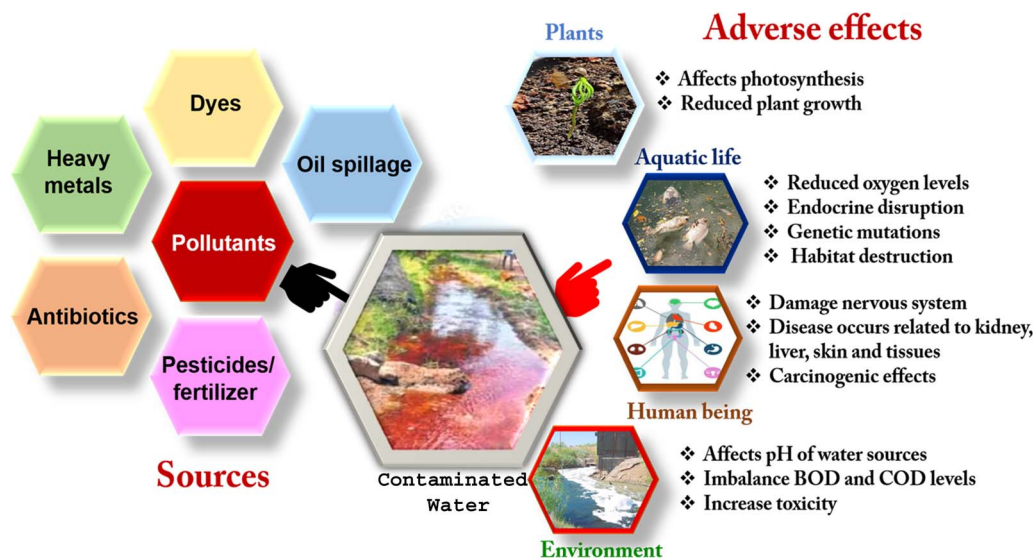
Fig. 1 Sources of wastewater and their adverse effects. 12

covered by water, only about 3% exists as freshwater, most of which is locked in ice and glaciers, leaving a small fraction available in liquid form in lakes, rivers, and groundwater. 3 This limited supply is increasingly threatened by a growing array of contaminants entering aquatic systems from multiple sources (Fig. 1). A major contributor to this crisis is the proliferation of emerging organic contaminants (EOCs), a diverse group of both well-known and newly developed chemicals with significant ecological and human health risks. These include pharmaceuticals, personal care products, pesticides, veterinary drugs, industrial byproducts, food additives, and engineered nanomaterials, hundreds of which have been detected globally in water bodies. 5,6 Their sources are varied, ranging from inadequately equipped WWTPs and hospital effluents to livestock waste, septic systems, and industrial discharges. Conventional treatment technologies often fail to effectively remove these persistent pollutants, allowing them to accumulate and exert long-term environmental impacts. 7,8