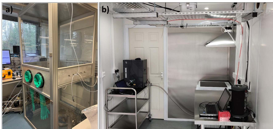
Fig. 1 (a) The emission testing chamber (b) interior view of the DOMESTIC kitchen facility and cooking station.

Simulated cooking and cleaning experiments were conducted following in-house developed protocols based on the recommended manufacturer guidelines for product use and for general cooking recipes used commonly in UK households. 22–24 Realtime measurements of VOCs were conducted using a Selected Ion Flow Tube-Mass Spectrometer (SIFT-MS; Voice200 Ultra; Syft Technologies, New Zealand). 21,22,25,26 Off-line samples of post-activity indoor air were also collected in 3 L SilcoCan air sampling steel canisters (Restek, USA) and analysed using a TD-GC-MS (TD: TT24-7 Series 2, Markes International; GC-MS: 6850/5975C Quadrupole, Agilent Technologies), for speciated information on VOCs such as monoterpenes. More details on the instrumentation (and their acronyms) can be found in Table S1 in the ESI.† Initial screening of the cleaning and home-scented products was performed using equilibrium headspace GC-ToF-MS, following the protocols described in Harding-Smith et al. 27 The GC-ToF-MS experiments informed the targeted analysis of selected masses on SIFT-MS in the ion-selective mode, during the scripted cleaning and home-scented product use in the emission testing chamber. The targeted analysis of VOCs during the cooking experiments was based on the initial screening of emissions in the full mass