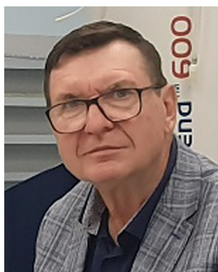
Marek J. Potrzebowski

The aim of this review is to summarize recent findings in the field and highlight the importance of chirality in the self-organization of short peptides. Special focus is given to its effects on the assemblies across different size scales – all the way from atomic to macroscopic characterization. In the following sections, we discuss how the chirality of amino acid residues influences crystal structure and molecular packing, leads to the formation of various self-assembling morphologies, and finally results in materials of different properties, with a particular focus on the supramolecular gels. Upon conclusion, a few crucial remaining questions and future perspectives are also delivered.