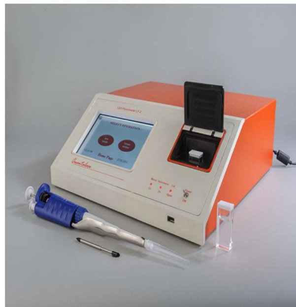
Fig. 2 LED fluorimeter (model LF-2) (Quantalase, India).

Humic substances are complex and heterogeneous mixtures of polydisperse materials formed in soils, sediments, and natural waters by biochemical and chemical reactions during the decay and transformation of plant and microbial remains (a process called humification). Thus, humic substances are a fraction of natural organic matter and are involved in many processes in soils and natural waters: e.g. , soil weathering, plant nutrition, pH buffering, trace metal mobility and toxicity, bioavailability, degradation and transport of hydrophobic organic chemicals, formation of disinfection by-products during water treatment, and heterotrophic production in black water ecosystems. 45 Organic material, especially humic acids (HA) and fulvic acids (FA), also play an important role because of the complexation as well as the sorption processes. 46,47 As stated and observed by Riggle and Wandruszka in their work on the stability of uranium(vi) complexes of humates and fulvates in biphasic systems, slight momentary heating of aqueous solutions (by \sim 10^\circ\text{C} ), containing humic substances (HSs) and uranyl ions