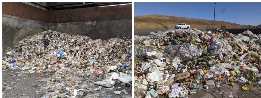
Fig. 3 Images of plastic contamination in organic waste streams. Photos taken at Zero Waste Energy Development Company in San Jose, CA and Yolo County Central Landfill in Woodland, CA.

Implementing more circular plastics systems requires handling an increasingly variable set of feedstocks. Most recycling technologies are polymer-specific and require fairly pure input streams. 4 In short, they are not tolerant to contamination from other plastics or non-plastic materials; some contaminants (such as metals or chlorine-containing compounds) may be more problematic than others. Understanding the nature of likely plastic waste feedstock streams is important because the level of contamination in an input waste stream to a recycling process and the associated need for preprocessing can have a substantial impact on the final LCA results of a circular plastic system. 13