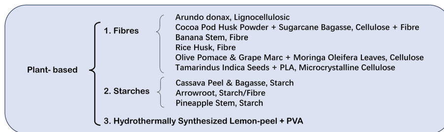
Fig. 1 Plant-based biodegradable packaging materials.

Fontes-Candia et al. 91 demonstrated the innovative utilisation of Arundo donax lignocellulosic waste biomass in the production of highly porous and bioactive aerogels. These aerogels exhibit remarkable water and oil sorption capacities, comparable to those of chemically modified nanocellulose aerogels, thereby highlighting their functional effectiveness. Additionally, the study augmented these aerogels with significant antioxidant properties by incorporating extracts from A. donax biomass, particularly the stem extract generated through heating (S-HW), which is rich in polysaccharides and polyphenols. Furthermore, their ability to reduce colour loss and lipid oxidation in red meat during refrigerated storage positions these aerogels as promising candidates for bioactive food packaging materials.