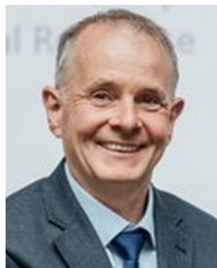
Paul V. Murphy

The endo -anomeric effect 9 is stereoelectronic, requiring an electron withdrawing heteroatom (O-5) in the ring and an electron withdrawing atom (O-1) at C-1. One model proposed to explain the endo -anomeric effect is hyperconjugation (Fig. S2, ESI † ), possible when the anomeric substituent is axial, but, not when equatorial. Another proposal to explain the effect is based on minimisation of electrostatic repulsion between oxygen atoms. Explaining anomeric preference is, however, more complex and influenced by multiple factors 10 such as solvent, and the extent of steric repulsions, which are reduced by electron withdrawing substituents. 11 The endo -anomeric effect gives rise to the exo -anomeric effect (Fig. S3, ESI † ), which is considered