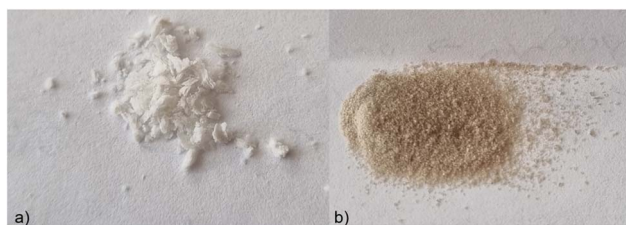
Fig. 9 Samples of precipitated glycans from (a) cold water and (b) hot water extraction.

Molecular weights of 13.0 kDa (cold water glycans) and 12.1 kDa (hot water glycans) with a polydispersity of approx. 1.4 were measured. The increasing molar mass curve indicates anchoring effects between the branched macromolecule and the stationary phase. 28 The effect of anchoring was considered during data processing and is in this case not decisive for the resulting M_w .