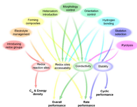
Scheme 2 Relationship between strategies and device performance.

provide improved stability. The high temperature treatment of COFs generates heteroatom-doped carbon materials with a mixture of conjugated and nonconjugated backbone.