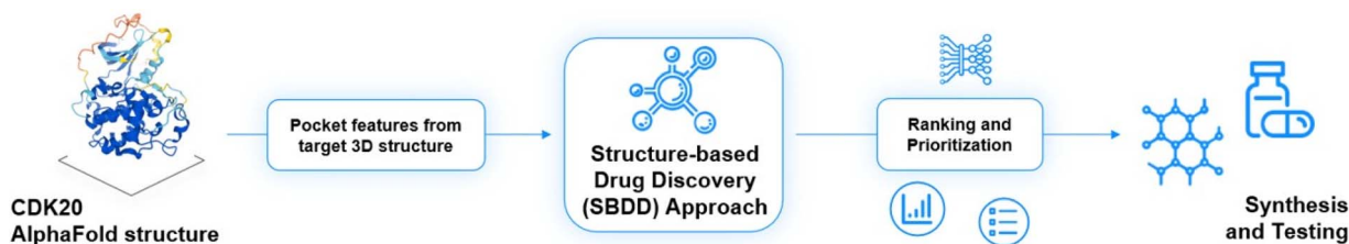
Fig. 3 In silico Medicine generative procedures for CDK20 hits.

After uploading a protein structure to the Chemistry42 platform, the built-in energy-based approach is automatically used in order to determine putative binding sites. The surface of the protein is evenly covered with probes (methyl), and the energy of non-covalent interactions with the receptor atoms is calculated for each probe. Probes having energy lower than a user-defined threshold are clustered into separate pockets. Each identified cavity is scored using pocket volume, surface, and depth descriptors. Based on these descriptors, Chemistry42 provides a list of identified binding sites.