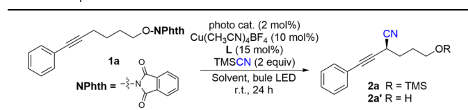
Table 1 Optimization of the reaction conditions a,b

To get more insights into the reaction mechanism, we first measured the reduction potential of 1a to be E_p^{0/-1} = -1.51 V vs.