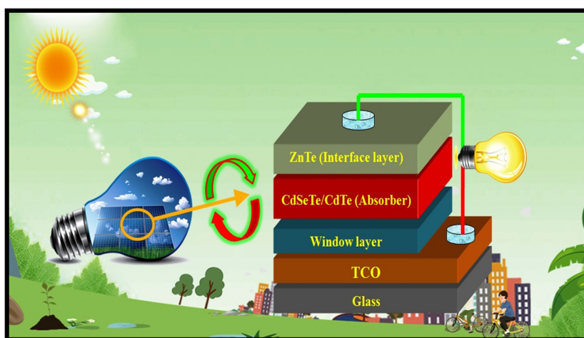
Fig. 13 Pictorial view of ZnTe back contact comprised of CdSeTe/CdTe thin film solar cell device structure together with natural conditions.

Although the CdTe semiconducting material is a promising absorber material for thin-film solar cell devices, the maximum achieved open circuit voltage ( V_{oc} ) for these devices is still lower than the theoretically predicated V_{oc} due to the barriers developed at the back contact. A simple CdTe device with the configuration of glass/FTO/CdS/CdTe/ZnTe:Cu/Au, as shown in Fig. 14, was developed with copper-doped ZnTe as the back