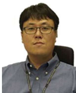
Sung Jong Yoo

A high-temperature pyrolytic method is also one of the prevalent methods to fabricate M@C core-shell materials. 52,54,56,84–102 Pyrolysis methods involve the heat treatment of precursor compounds at high-temperatures (>500 °C) under inert gas atmospheres ( e.g. , N 2 or Ar) wherein the precursor containing metal organic frameworks (MOFs) decompose to release simple volatile molecules (CO 2 , nitrates, sulphur oxides, NH 3 , volatile organic vapors, etc. ), leaving a carbon material as a support (or frame) with carbon-encapsulated metals or alloys. 56,68,69,84–88 In particular, pyrolysis is widely used for the synthesis of