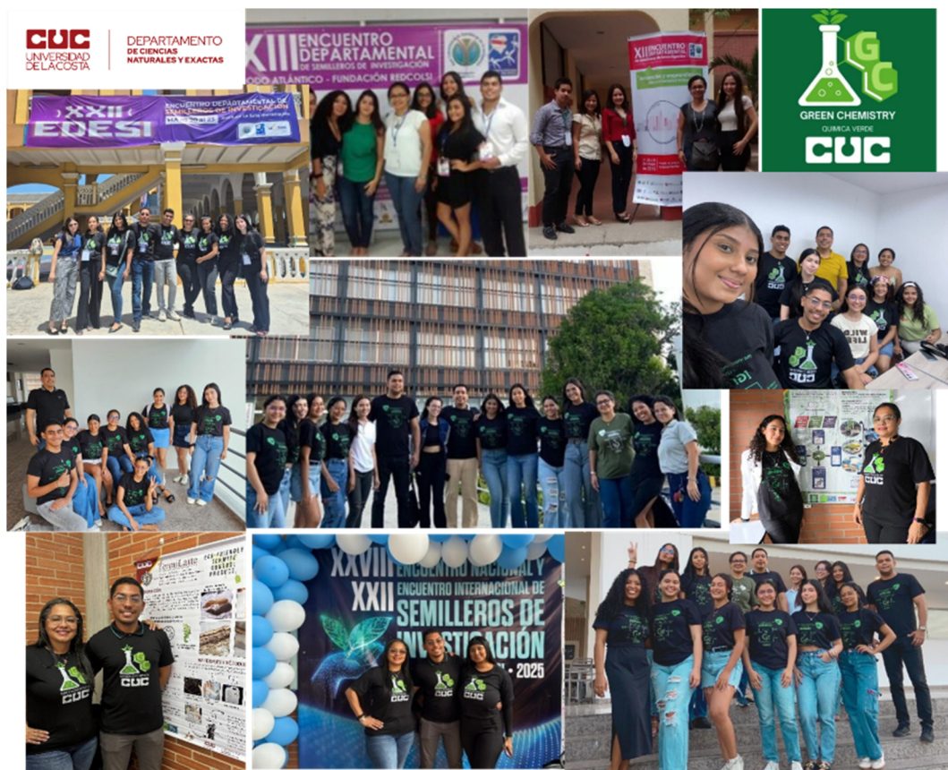
Fig. 1 Green chemistry research hotbed – a decade.

development of the research process, including proposal formulation, methodological design, experimental implementation, data analysis, and preparation of the final report, ensuring academic and methodological rigor. The students present their final work before a jury evaluator. The jury evaluators are faculty members from the Environmental Engineering program whose academic experience and thematic expertise are aligned with the project topic. They are responsible for assessing the written final report and the oral defense based on previously established evaluation criteria. The students have the autonomy to decide on the focus of their work, and the tutors play the role of an expert guide throughout the process, providing guidance and assistance as needed.