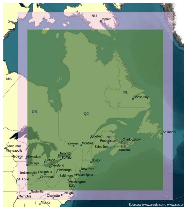
Fig. 1 Geographical domain of the study region. The pale shaded region indicates the domain of the high-resolution GEOS-Chem simulations and the green shaded region indicates the domain of the emulator. Canadian provinces and territories are labelled by postal abbreviation. NL: Newfoundland and Labrador, PE: Prince Edward Island, NS: Nova Scotia, NB: New Brunswick, QC: Quebec, ON: Ontario, MB: Manitoba, NU: Nunavut.

All anthropogenic emissions are set to those of the year 2010, in order to study only the effect of meteorology on pollutant concentrations without interannual changes in emissions. Anthropogenic emissions for Canada are provided by the Air Pollutant Emissions Inventory (APEI), and anthropogenic emissions for the US are provided by the National Emissions Inventory for 2016, 28 multiplied by a species-specific scaling factor to account for changes in emissions between 2010 and 2016. Anthropogenic emissions outside of Canada and the US, as well as shipping emissions globally, are provided by the Community Emissions Data System version 2 (CEDSV2). 29 Fossil fuel and biofuel emissions of C_2H_6 are overwritten by the updated inventory of Tzompa-Sosa et al. 30 Outside of Canada