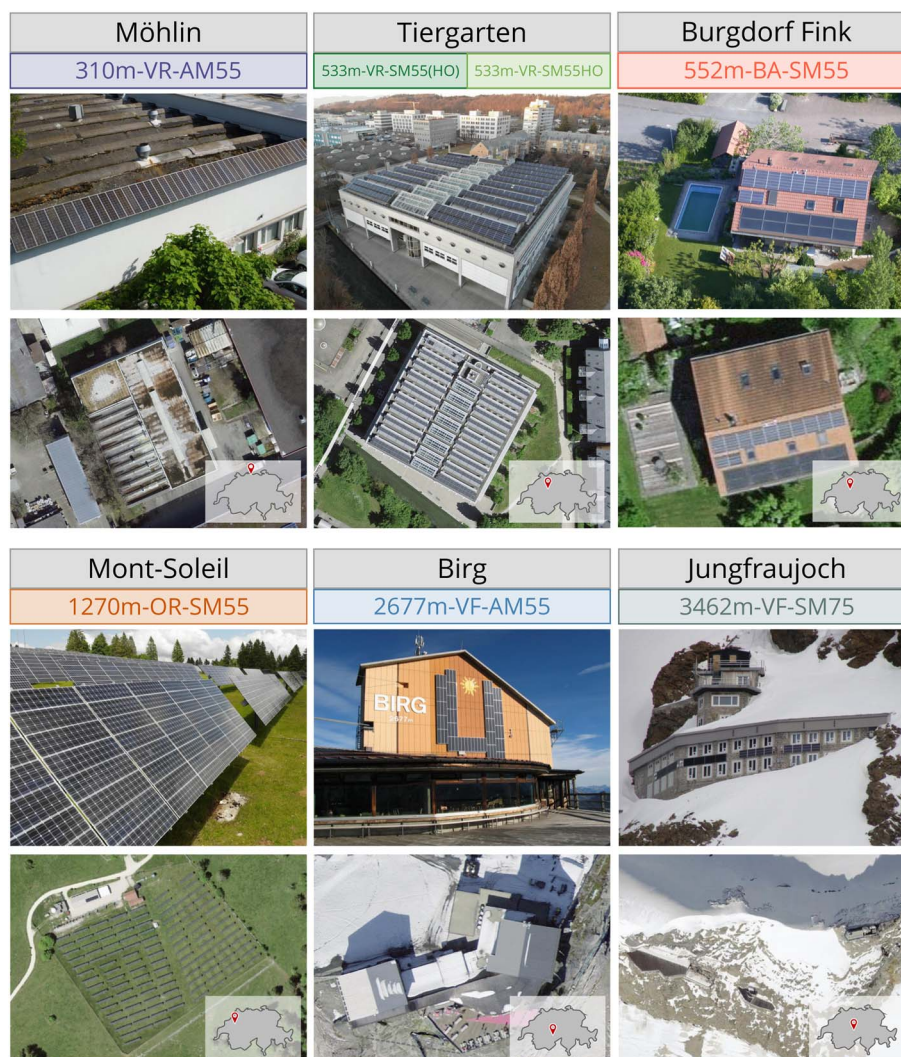
Fig. 2 System photos, showing the profile view (top) and aerial view (bottom). Approximate location in Switzerland is indicated in the bottom right corner. The Tiergarten system is separated in the East and West parts of the rooftop in the data and results. Site IDs are indicated below the system name, following the defined format: [Altitude]–[Mounting Config.]–[Module Type], see Table 1.