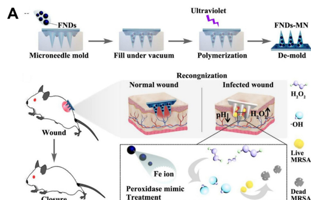
Fig. 3 (A) Schematic diagram of how the ligand polymer nanoparticle enzyme integrated colorimetric microneedle patches are made and how they are used to detect and treat wound infections. 80

Microneedle patch sensors offer significant advantages in drug delivery and sensing physiological signals. For example, microneedle patches can increase permeability and can facilitate the delivery of various drugs. It has also been demonstrated that the same microneedle-based sensor prevents sweat contamination and signal noise during sensing while also minimizing damage to dermal nerves and blood vessels. 81 For wound healing and sensing, an origami smart silk fibroin-based microneedle dressing (i-SMD) with an inverse opal photonic crystal (IO PC) structure, microfluidic channels, and microcircuits was proposed (Fig. 4A). 82 By using capillary force, the microfluidic channels can direct the liquid flow to the area of detection, making it possible to detect biomarkers in liquid without the need for an external power supply. 82 Microelectronic circuits can monitor activity in the trauma area and reduce secondary injuries caused by exercise.