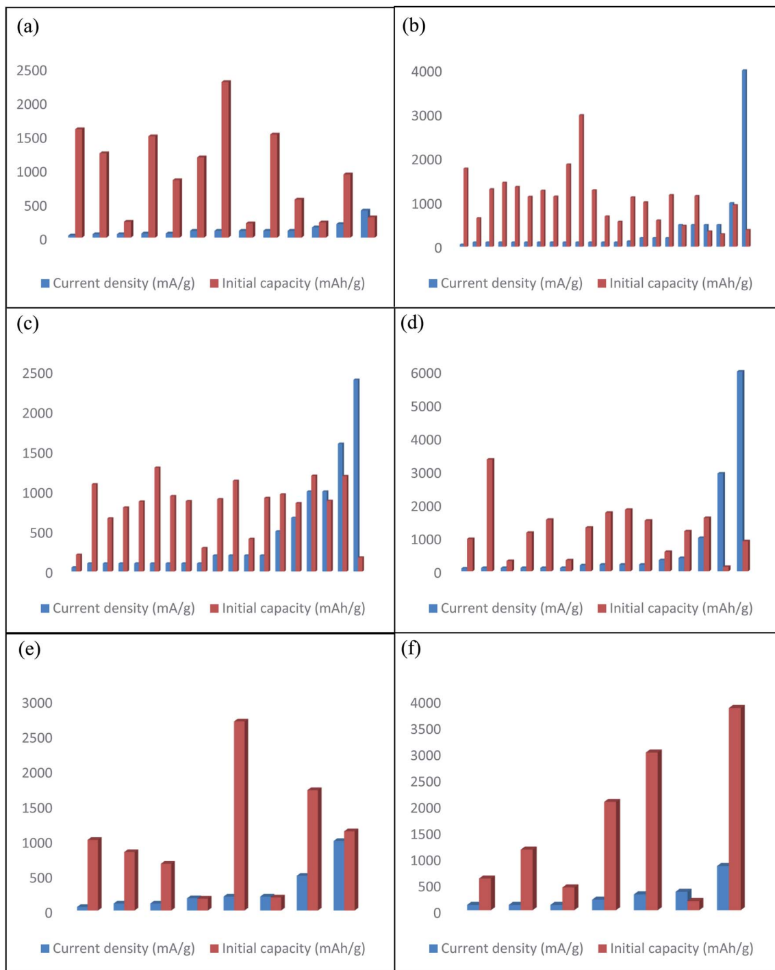
Fig. 8 Highest initial capacity at the certain current density of (a) CNT, 24–26,30,31,33,36,39,40,42–44,48 (b) CNFs, 52,55–60,62–75,77,78 (c) graphene, 85–87,90–102,104,105,107 (d) CFT, 111,113–120,122,123,125,126,129,130,134–136,138,142–145 (e) carbon coating/foam, 134–136,138,142–145 and (f) metals-supported 178,179,181,184,190,192 flexible electrodes.

refers to the angle between X and the tangent of the moving end. The bending angle is controlled between 0^\circ to 180^\circ and the smallest R is obtained as less than L_0/\pi ( L_0 defined the length between the two ends of testing sample). Thus, this process can be used for the measurement of R due to the bending condition is controlled by an automated machine with uniform distribution of stress and variation speed of bending angle that can be