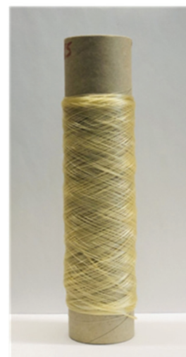
Fig. 4 Temperature sweep rheological data of PAU-86 (left) and a roll of PAU-86 fibre melt-spun at 185 °C (right).

140 °C to 220 °C at 3 °C min -1 (Fig. 4). As a result, G' and G'' intersect at 165 °C, indicating that the material starts to flow. This temperature is therefore considered as the lower limit for melt processing. On the other hand, the \tan \delta curve showed a peak at 186 °C, at which the material exhibited the most viscous character. This was considered the highest suitable processing temperature where degradation could be avoided. Therefore, the processing window of PAU-86 was set between 165 and 186 °C. In addition, another intersect between G' and G'' curves was observed at higher temperature (~210 °C), which indicated degradation and gel formation. This was confirmed by the observation that the sample after the melt rheology measurement significantly expanded with bubbles contained, and the sample became only partially soluble in THF (while the pristine sample was fully soluble in THF). The 1 H NMR spectrum of the soluble fraction of the sample after the measurement showed the signals for Monomer T (Fig. S39, ESI†), indicating the degradation of urethane units at 220 °C. This was also consistent with the previously discussed TGA results.