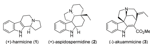
Fig. 1 Representative indole alkaloids.

instead of the expected dihydro- \beta -carbolines (Scheme 1A). 11 Our ensuing mechanistic investigation revealed a highly complex cascade pathway (Scheme 2) which proceeds via several intriguing intermediates. 11 In particular, the tetracyclic spiroindoline 10 caught our interest, owing to its wide-spread presence in indole alkaloids. 7i Unfortunately, our efforts to isolate 10 ( \text{R}^1 = \text{H} ) were futile, frustrated by an elimination step (Scheme 2A) that always follows. Indeed, we only succeeded in diverting the cascade towards a different carbazole product if \text{R}_3 = \text{Br} (6, Scheme 1A). This strongly suggests that