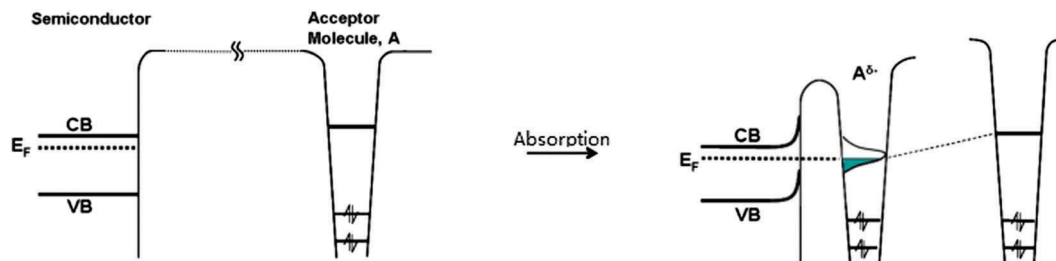
Fig. 4 Schematic diagram shows the adsorption of an acceptor molecule (A) onto a semiconductor surface. Modified from ref. 7 with permission of the American Chemical Society.