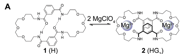
Fig. 3 (A) The structure of the host (H) 1 and its 1:2 host–guest ( \text{HG}_2 ) complex 2 . (B) The four different binding models (flavours) based on (7) that can be used to describe a 1:2 equilibria. Reproduced with permission from ref. 18.

The most useful indicator used to select a binding model in this study was \text{cov}_{\text{fit}} obtained from (12). The more complex model, and hence the number of parameters fitted, the better the fit generally is. To justify the selection of a more complex model such as the full 1:2 model over a simpler 1:2 additive model,