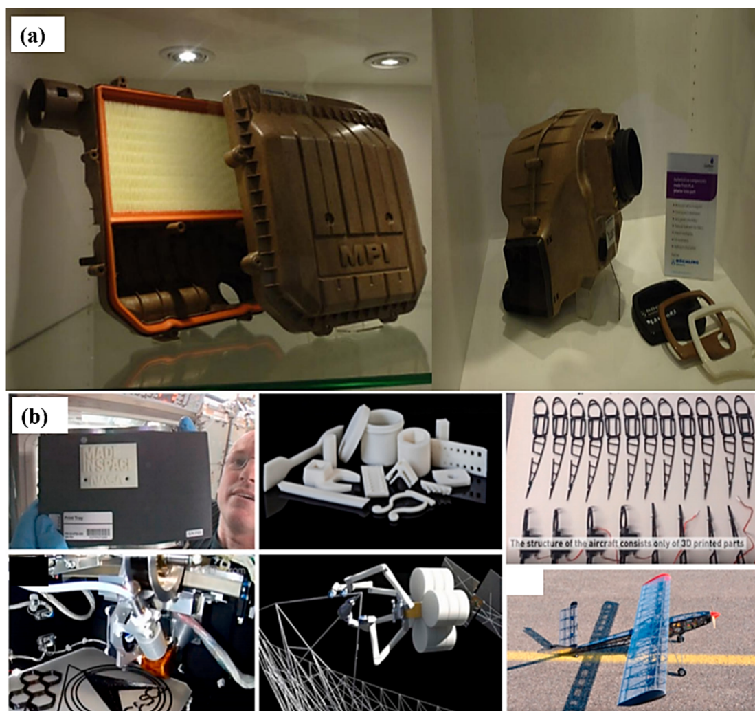
Fig. 8 (a) 3D printed air filter box and (b) space 3D printing and 3D printer parts from NASA's SpiderFab (reprinted with permission from ref. 18 and 123 Dananjaya S. A. V., Chevali V. S., Dear J. P., Potluri P., and Abeykoon C., 3D printing of biodegradable polymers and their composites-current state-of-the-art, properties, applications, and machine learning for potential future applications, Prog. Mater. Sci. , 2024, 101336 and Tuli N. T., Khatun S. and Rashid A. B., Unlocking the future of precision manufacturing: a comprehensive exploration of 3D printing with fiber-reinforced composites in aerospace, automotive, medical, and consumer industries, Heliyon , 2024, 10(5), e27328. Creative Commons Attribution 4.0 International License CC BY-NC-ND, https://creativecommons.org/licenses/by-nc-nd/4.0/ ).

that benefits from 3D printing. Additionally, it makes it easier to create distinctive, personalized, and one-of-a-kind packaging, which improves customer interaction and product branding. Companies can rapidly create eye-catching packaging that works well for marketing. The appropriateness of sugarcane bagasse for creating customized three-dimensional food packaging casings and its biodegradability, printability, and water absorption qualities were examined in a study by Nida et al. Furthermore, as a sustainable choice for 3D food packaging, they evaluated the printability of rice husk (RH) fractions, including milled (MRH) and mixer ground (MGRH), with and without guar gum (GG). 118 Only MRH with GG was extrudable, allowing steady printing under optimal conditions at 2100 mm min -1 , 300 rpm, and 4 bar pressure. Additionally, they studied sugarcane bagasse (SCB) for its printability and biodegradability in custom food packaging. With a 1.28 mm nozzle,