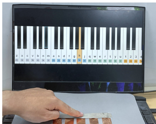
Fig. 8 Analysis of sensing performance using the piano of woven fabric electrode.

The presence of LiCl in the plain ionic hydrogel can influence the reaction by controlling the reaction conditions, such as temperature and ionic environment. This synthesis method