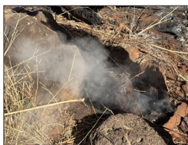
An underground fire was found during the field investigation.

Some animal watering equipment was unaffected, and other equipment seems to be contained or be coated with particulate. This included livestock tubs, troughs, and tire waterers.