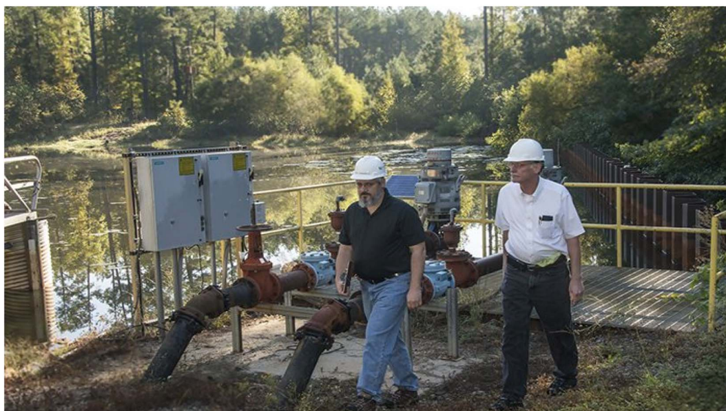
Fig. 3 Top – Sub-processes of phytoremediation, showing phytovolatilization, phytoextraction, rhizofiltration and phytostabilisation. 3 H is released into the environment through the former-most option, diffusing into the atmosphere through leaves rather than being expelled by the roots. Bottom – Photo from DOE 112 showing Savannah River Nuclear Solutions engineers examining pumping equipment next to the 3 H-contaminated groundwater storage pond. Water is pumped from the pond and used to irrigate the surrounding woodland, where evaporation and phytovolatilization release 3 H into the atmosphere.