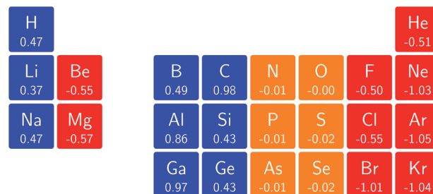
Fig. 6 Initial responses of the ionization energy in a magnetic field as a periodic table representation showing both the numerical values and categorising them with a color code in which blue indicates a positive derivative, red a negative derivative and yellow a derivative that is zero or close to zero.

From these response properties, a periodicity can be discerned which is different to that for the zero field