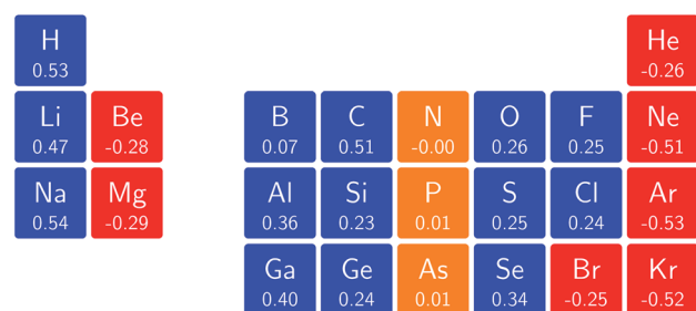
Fig. 10 Initial responses of the hardness in a magnetic field as a periodic table representation showing both the numerical values and categorising them with a color code in which blue indicates a positive derivative, red a negative derivative and yellow a derivative that is zero or close to zero.