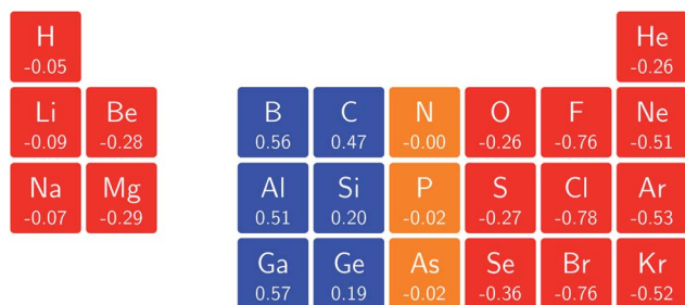
Fig. 8 Initial responses of the electronegativity in a magnetic field as a periodic table representation showing both the numerical values and categorising them with a color code in which blue indicates a positive derivative, red a negative derivative and yellow a derivative that is zero or close to zero.

Several general observations can be made from this analysis: the first is the similarity of the behaviour of atoms in a given group, secondly is that atoms belonging to a group with the highest value of the hardness in a period at zero field have a tendency to lower their hardness or at least keep it unchanged, whereas all other main group elements increase in hardness in