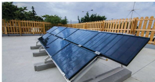
Fig. 26 2D materials-enabled perovskite solar farm installed in Heraklion (Crete).