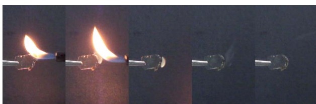
Fig. 4 Flammability of PU prepared by reacting PPDI with the PPC-diol prepared using phenylphosphonic acid as the chain-transfer agent (entry 15). The pictures were taken at 0.8 second intervals from a video clip.

thermograms of poly(propylene carbonate) itself (A) and of PUs prepared by reacting MDI (B and C, entries 9 and 11, respectively) with PPC-diol prepared by feeding 2,6-naphthalenedicarboxylic acid as the chain-transfer agent.