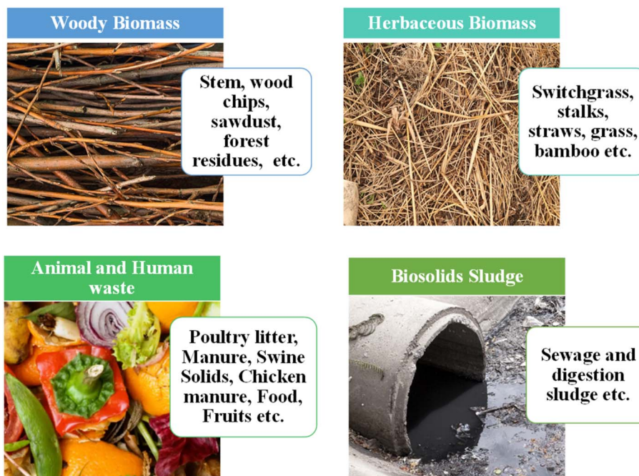
Fig. 2 Biomass feedstock categories. 39

Biofuels represent a category of sustainable fuels sourced from abundant biological materials known as biomass. This biomass encompasses diverse resources, including forestry products, agricultural residues such as straw, husks, and animal fat byproducts from food processing, industrial waste from pulp production and sewage, waste wood from construction and demolition and biodegradable waste. 44 Additionally, biofuels can be obtained from specific energy crops cultivated