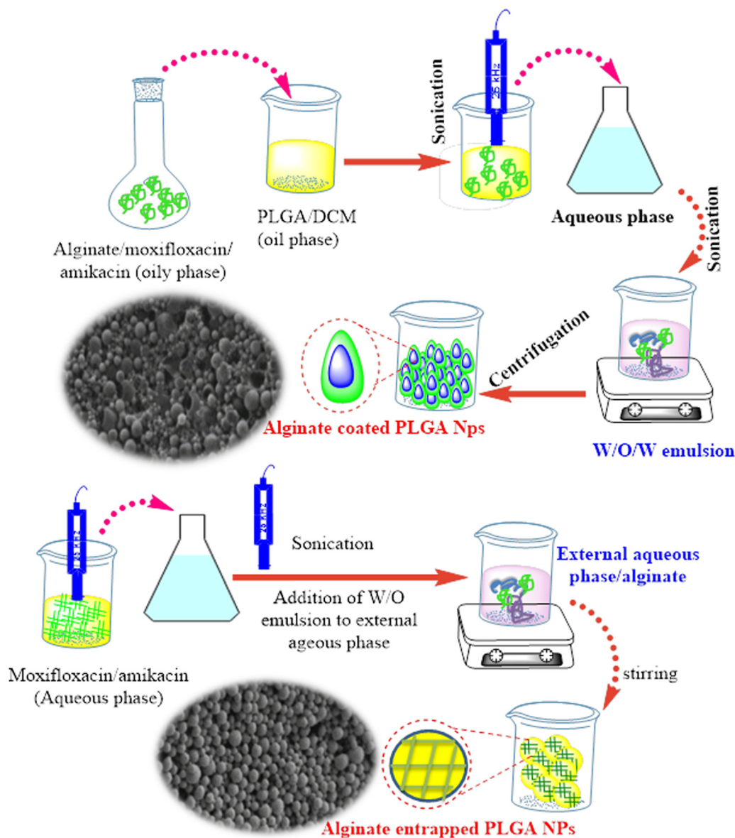
Fig. 4 Schematic presentation of alginate entrapped PLGA nanoparticles and alginate-coated PLGA NPs along with their respective SEM images. 51

used in the field of the medical diagnosis of several diseases, including tuberculosis. 66 They were incorporated into electrochemical and optical sensors for elevated sensitivity and better selectivity towards tuberculosis. 67,68 Fig. 5 lists the nanomaterials used in the optical detection of tuberculosis. In this review, a great focus has been placed on nanomaterials, such as Au nanoparticles (NPs), Ag NPs, cadmium telluride quantum dots (CdTe QDs), and nickel oxide (NiO) NPs, that are particularly used for the optical detection of tuberculosis. The sensing strategy is based on attractive physical phenomena, such as SPR-, SERS, and fluorescence emission. Table 3 lists the nanomaterial-based optical sensors used in the optical detection of tuberculosis.