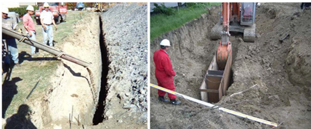
Fig. 2 Top – Diagram illustrating permeable reactive barriers in (a) continuous and (b) funnel and gate configurations at the Oak Ridge Y-12 Site, Tennessee. In both instances, contaminated groundwater passes through a reactive medium, where contaminants are removed, and clean water passes out the other side. Funnel and gate configurations have the addition of concrete barriers to channel groundwater flow. Bottom – Photos from ITRC 82 showing unsupported (left) and temporary trench box (right) excavation during PRB installation at non-nuclear industrial sites. Reactive media is poured into the hole to complete the PRB.

remediators' discretion. However, a less invasive approach was adopted at the Hanford site to reduce the ^{90}\text{Sr} activity reaching the Columbia River. 95 A solution of Ca, citrate and \text{PO}_4^- was added to the groundwater through boreholes, 96,97 creating a diffuse, continuous calcium phosphate (apatite) barrier that formed in situ from a series of discrete points at the surface. 98 Once formed, Ca in the apatite will substitute with Sr in the plume, as the existence of strontiapatite is more thermodynamically favourable than the initial hydroxyapatite. 99 Four pilot boreholes were initially injected between 2006 and 2008, with pre-barrier activities ranging from 36.5 \text{ Bq L}^{-1} to 171.3 \text{ Bq L}^{-1} ( 972 \text{ pCi L}^{-1} to 4630 \text{ pCi L}^{-1} ) ^{90}\text{Sr} . 6 As of 2021, activities within the boreholes have dropped to 4.1\text{--}23.5 \text{ Bq L}^{-1} ( 111\text{--}635