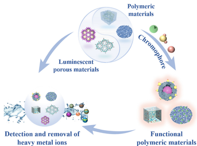
Fig. 1 Schematic diagram of functional materials fabrication and their applications for detection and removal of heavy metal ions.

detection and removal of heavy metal ions and fostering a better understanding of the future development in this research field.