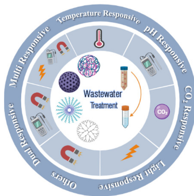
Fig. 1 Switchable stimuli-responsive polymeric materials in the wastewater treatment process, designed by biorender.com.

in response to pH variations. 106–108 Both negatively- and positively-charged polymers exhibit different degrees of swelling at different pH values depending on their ionic composition. 109,110 In general, pH-responsive polymers act as cationic polymers in acidic media and as anionic ones in basic media, showing different self-assembly behaviors depending on their structures. Upon changing from a neutral to a charged state, they can absorb oppositely charged ions and dyes through electrostatic interactions, without leaving any residue, which is highly applicable in wastewater treatment. 111 Among the other platforms, hydrogels are a more common type of pH-responsive polymer and they change their size upon a variation in the pH of the media, which can be used in the adsorption and release processes.