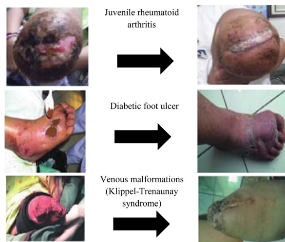
Fig. 3 Wound healing by coffee through human study. 81 Adopted with permission from ref. 81.

Histopathological studies on thirty-six New Zealand white rabbits supported the wound healing activity of green coffee bean extracts. Shahriari et al. 94 studied the green coffee bean extract in a full-thickness wound model. Coffee (10%) increased the wound closure rate, exhibited a shorter epithelialization