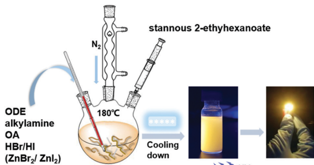
Scheme 1 Schematic diagram of the synthesis of the 2D (\text{RNH}_3)_2\text{SnX}_4 perovskites by a hot-injection method.

LEDs. 24 Ning's group reported hollow 2D layered (\text{HMD})_3\text{SnBr}_8 crystals synthesized by the antisolvent method. These crystals showed bright yellow luminescence with a PL QY of 86% and were used to fabricate remarkably stable WLEDs by mixing with commercially blue phosphor. 25 A (\text{C}_{18}\text{H}_{35}\text{NH}_3)_2\text{SnBr}_4 2D perovskite film was applied to produce orange LEDs, showing improved device performance than the 2D analogues, but the usage of toxic and expensive tri- n -octylphosphine (TOP) during the synthesis limited its large-scale application. 26 Recently, for the first time, our group synthesized highly emissive 2D tin-halide (\text{OCTAm})_2\text{SnX}_4 perovskites, in aqueous solution with a PL QY near unity and high stability in air. 27 We noted that Li's group reported the facile synthesis of 2D bulk tin-halide (\text{RNH}_3)_2\text{SnBr}_4 perovskites and explored the effect of different carbon chains on 2D organic tin-halide perovskites. 28